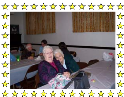
Oh look, here are some of the "happy campers" who attended.