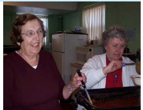
The "Chief Cooks"