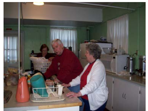
And "the Bottle Washers"